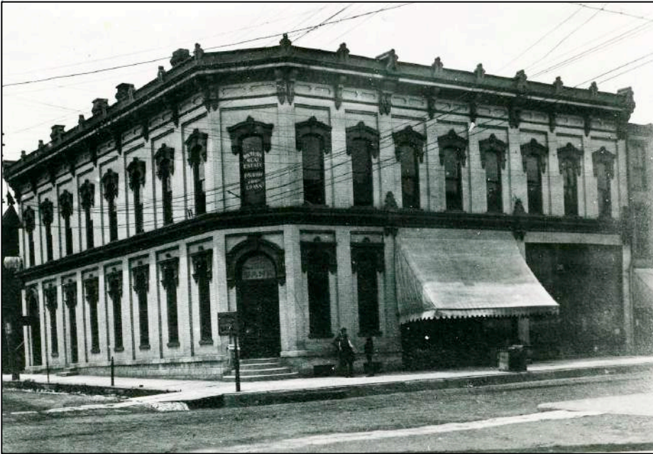
Farmers & Merchants Bank 1903. NW corner of Main and Center. Built 1876. HAC