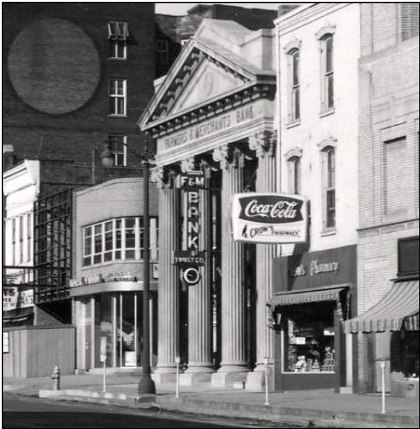
F&M Bank's location at 212-214 Broadway, late 1950s or early 1960s.